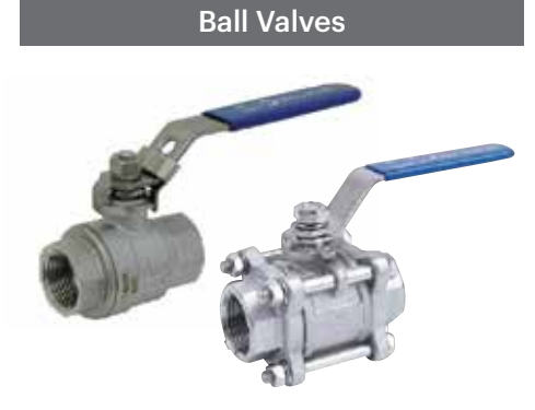
2 Piece & 3 piece 316 Stainless steel ball valves