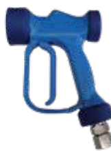
Low Flow Washdown Gun