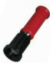
Heavy Duty Stainless Steel Nozzle