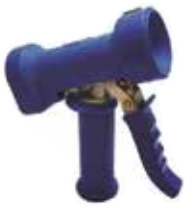
Hot Wash Stainless Steel Nozzle