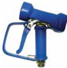
Heavy Duty Brass Nozzle