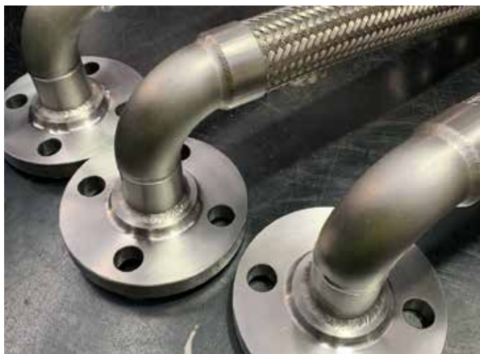
Custom Stainless Steel Hose Assemblies