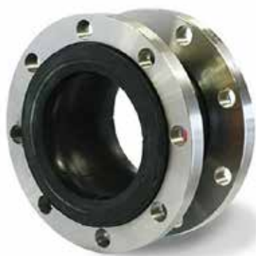
Rubber Expansion Bellows