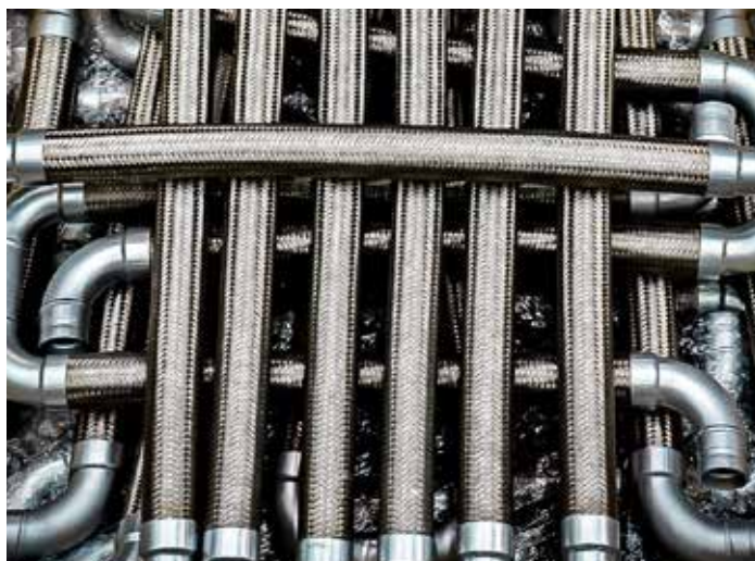
Seismic Joints Built To Earthquake Specifications